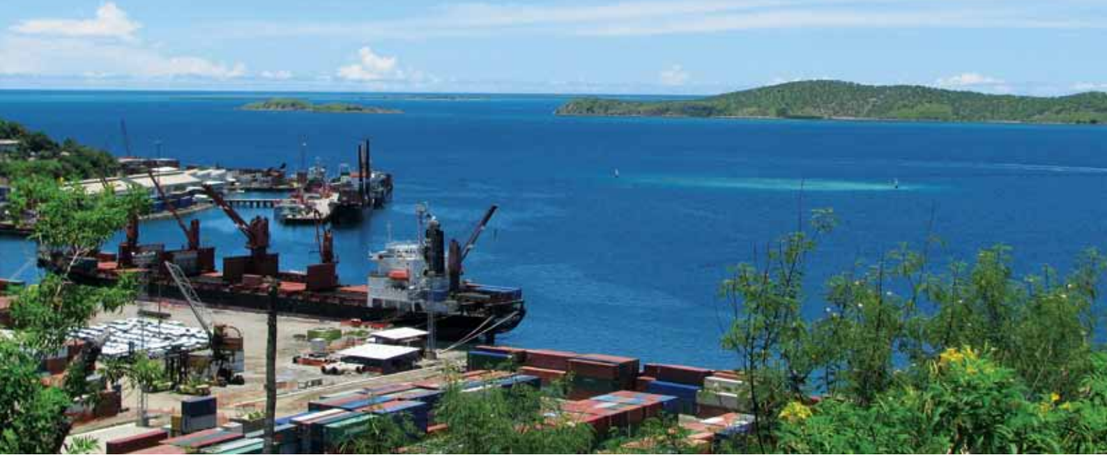
Port Moresby harbour